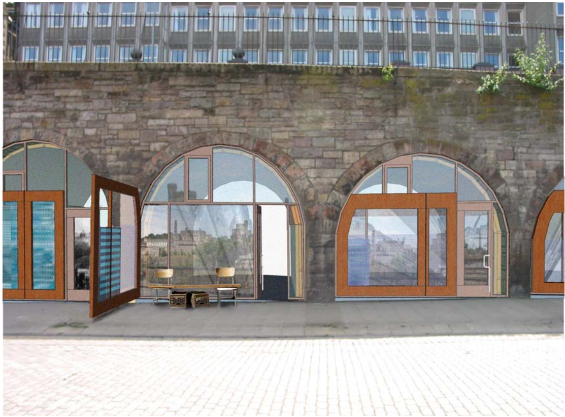
Elevation of proposed studio spaces