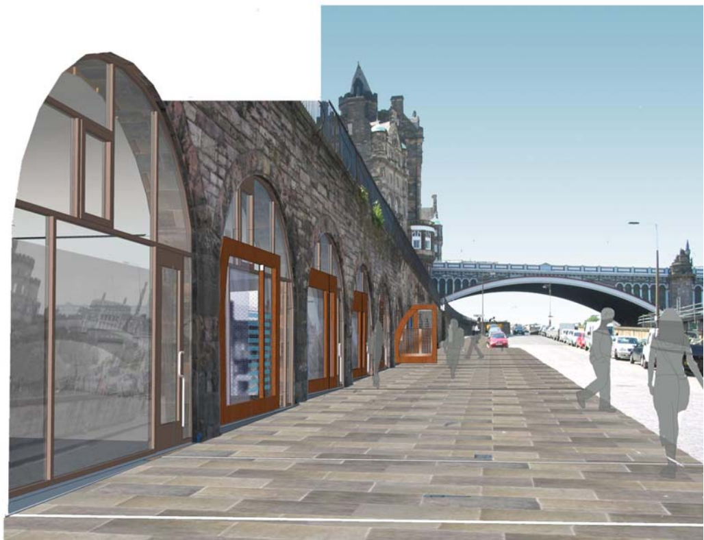
view west along East Market Street.