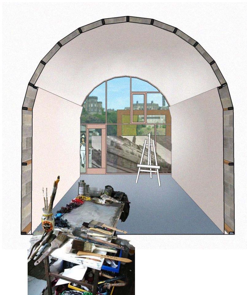
proposed arch interior